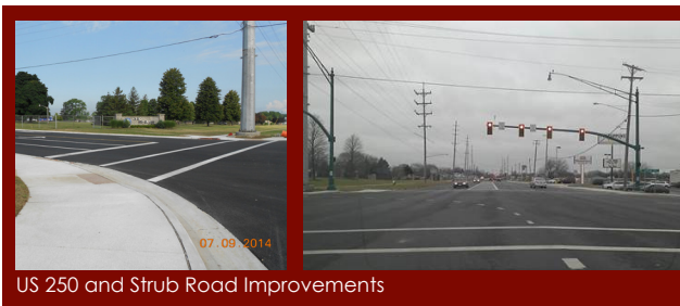
US 250 and Strub Road Improvements

An MPO does not have the authority to raise revenues or levy taxes. They are designed to allow collaboration between local officials on how to spend federal and other governmental transportation funds. Funding for the MPO is a combination of federal transportation funds and matching funds from state and local governments that is typically an 80/20 ratio.