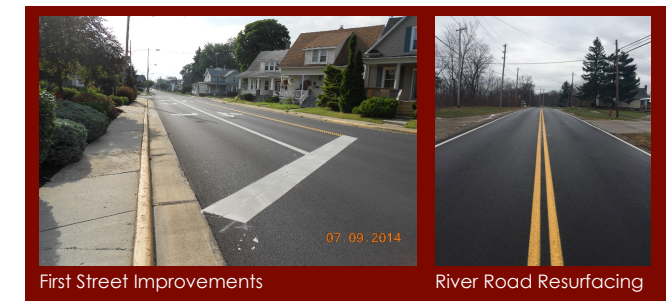
First Street Improvements

MPOs retain a core staff, referred to as the "Handling Agency". They are responsible for assisting the Policy Committee through the complexity of the planning process to ensure that it meets all federal and state requirements. Erie County Regional Planning serves as the handling agency.