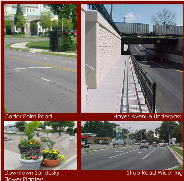
Cedar Point Road