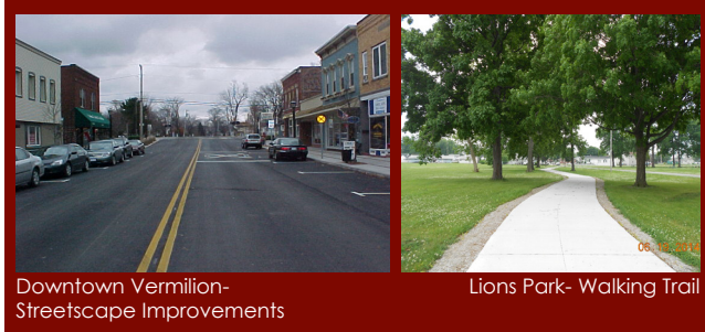
Downtown Vermilion- Streetscape Improvements

MPO's ensure that existing and future expenditures of federal funding are based on a continuing, cooperative, and comprehensive planning process.